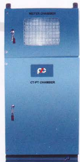
11 KV Metering Cubicle with Bottom Cable Entry

* Due to continual efforts to improve the design & quality of the product, the supplied product may differ from the picture illustrated in this brochure.