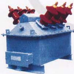
11 KV CT-PT Combined Unit (Dry Type / Oil Cooled)