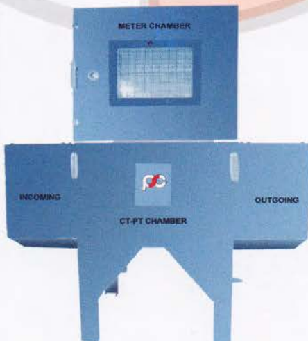
11 KV Metering Cubicle with Side Cable Entry