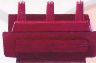
11 KV R.C. P.T.