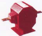
11 KV R.C. C.T.