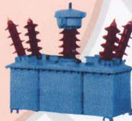
22 KV/33 KV CT-PT Combined Unit (Oil Cooled)