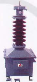
33 KV Oil Cooled P.T.