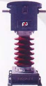
33 KV Oil Cooled C.T.